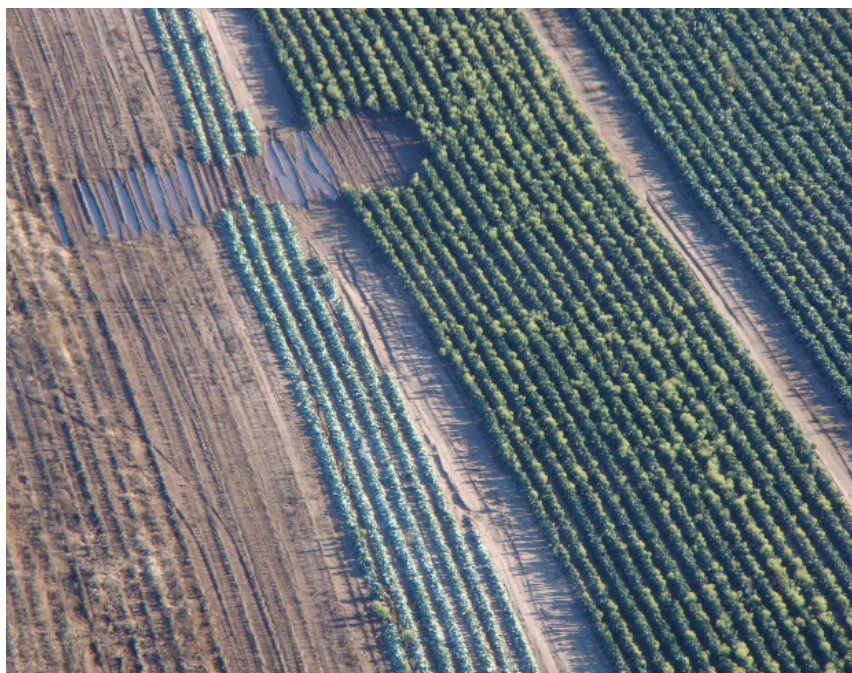
Continuity III – Moriah Hampton