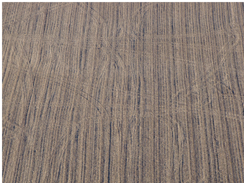
Continuity II – Moriah Hampton