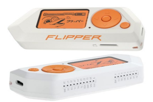
FLIPPER ZERO DEVICE

(U//FOUO) The PaCIC has observed increased interest in low power, handheld digital hacking tools across clear web and dark web sources. The PaCIC is providing this bulletin for situational awareness of an increased interest specifically in the Flipper Zero device, a digital hacking and penetration testing tool capable of scanning nearby radio signals, copying signal data, writing captured data to a secondary device, and/or broadcasting the data to a suitable receiver. The device can be used to activate access control systems, to include some security gates, garage doors, and other keyless entry systems. The device can also be used to initiate keystroke injection attacks against vulnerable systems.